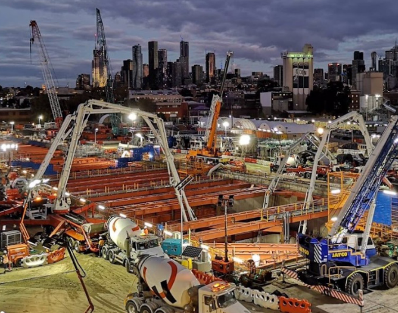
Metro Tunnel, Melbourne