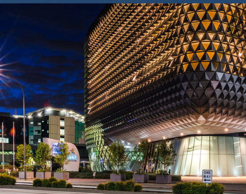
Royal Adelaide Hospital, Adelaide