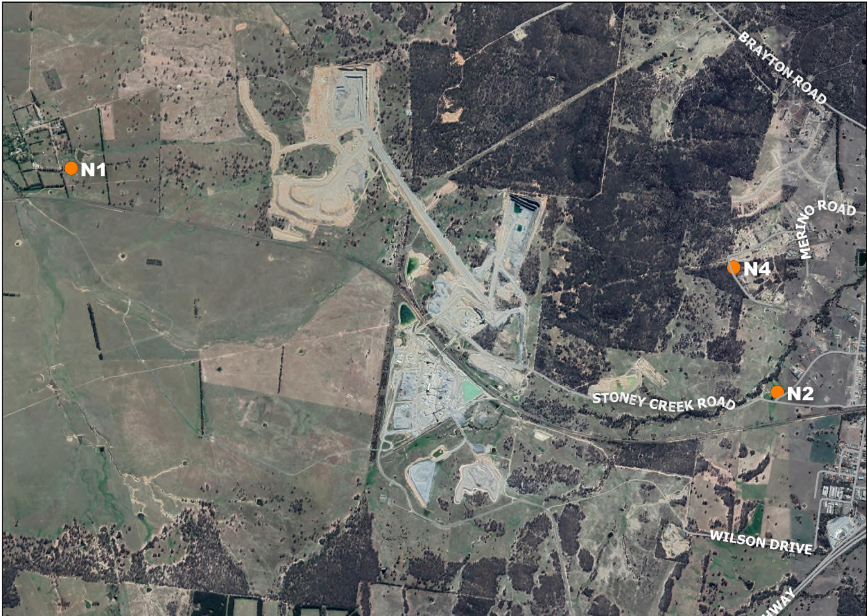
FIGURE 1 Site Locality MAC180611-02 Holcim Lynwood Quarry