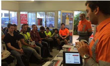
Curtin University engineering students during their site-based learning visit to our East Perth concrete plant in 2016.

Once again, engineering students from Curtin University will be visiting in May as part of an annual program to provide site-based learning. Up to 100 students in their fourth year of tertiary studies in engineering will attend to learn about Holcim's Safety Management System and Quality Management System. After a presentation by Holcim, students will take a guided tour to see first hand how safety and quality influences engineering decisions.