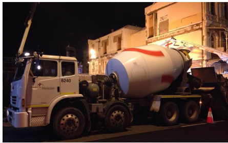
Holcim supplied concrete to the Old Melbourne Hotel build in Perth.

We recently started supplying concrete to the QT Hotel project on the corner of Murray and Barrack streets. Soon, Holcim's East Perth operation will commence concrete supply to the DoubleTree by Hilton Perth construction project.