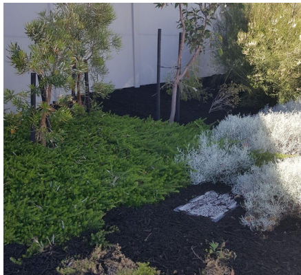
Claisebrook Road sidewalk landscaping works completed.

The Caversham Road and Claisebrook Road sidewalks, which border our property, were looking a little untidy. To improve the visual appearance around our operations we engaged a landscaper to carry out improvements on both of these areas.