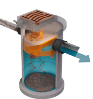
STC 2 (inlet)