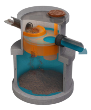
Figure 2 – HumeCeptor<sup>®</sup> system operation during high flow conditions